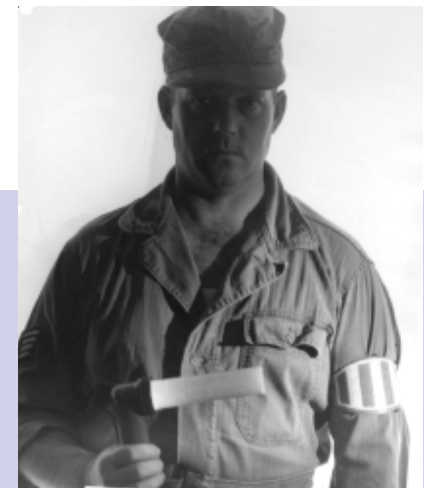
The "Lackland Lasar" made its debut in 1953