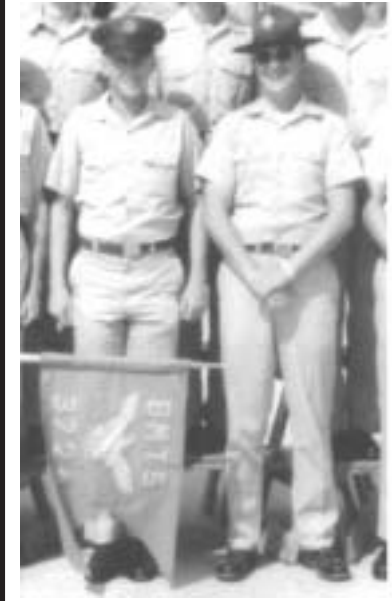
The future 43rd President of the United States, George W. Bush, was a BMTS honor graduate in May 1968.