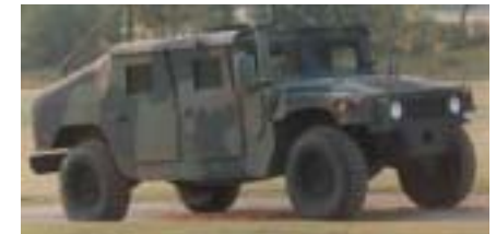
The Security Police Academy began training with the new High Mobility Multipurpose Wheeled Vehicle (Humvee) in 1986.