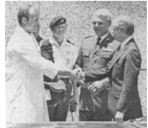
President Carter visited Wilford Hall April 1980

3701 3703 3706 3707 3708 3709 3710 3711 3723 3743