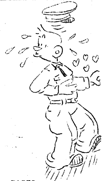
BASIC: On Conduct in Town.