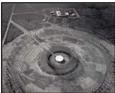
AN/FLR-9 Antenna, Clark Air Base, Philippines 1965

The massive circular antenna system, often referred to as the 'Elephant Cage' for its size, spanned