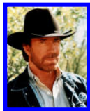
C. Chuck Norris