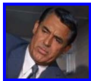
A. Carey Grant

Which celebrity did not train at Lackland AFB?