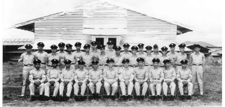
Air Force BMT, Squadron 13, April 1953 Clark Air Base, Philippines

During the Korean War, Air Force Basic Military Training expanded to accommodate the immediate need for a larger, stronger Air Force – to that end, additional bases opened up within the continental US along with other locations in the UK, Panama and the Philippines! In most cases, young recruits went through an abbreviated BMT course before attending technical training or reporting to a direct duty assignment.